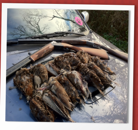
NICE BAG AM ON POINTERS